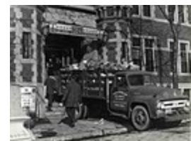
Forerunner of the Thrift Sale....the vision continues.